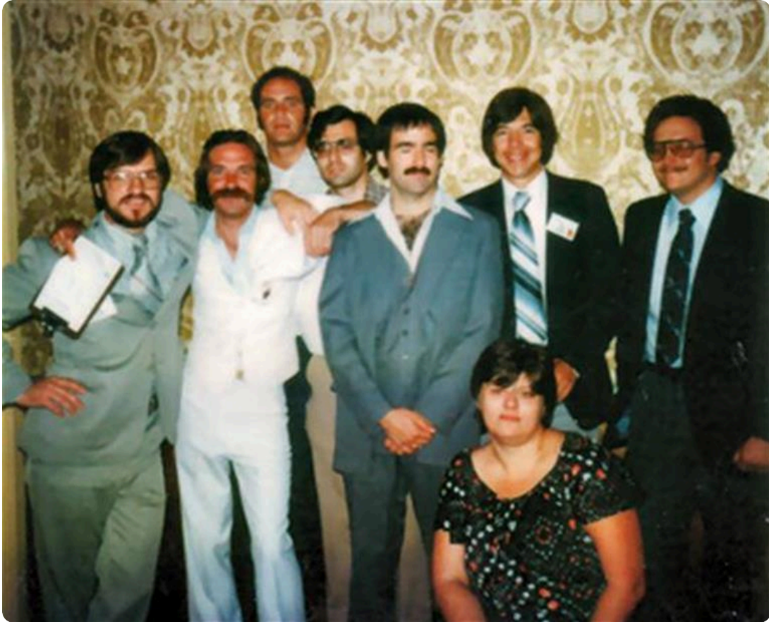
1979 Florida YD Convention.